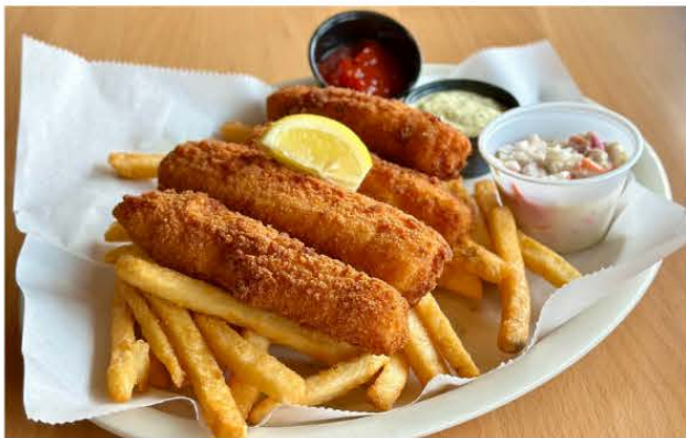
Fish and Chips