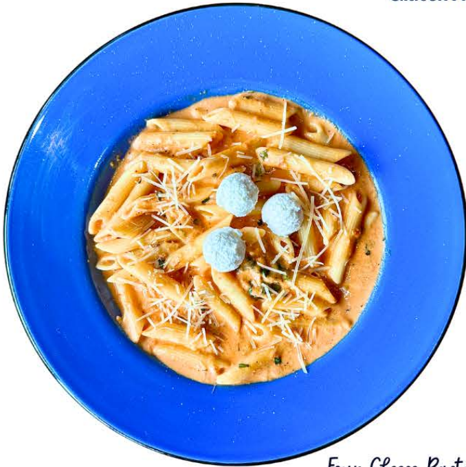
Four Cheese Pasta