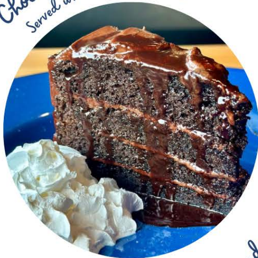
Chocolate Fudge Cake Served w/ vanilla ice cream