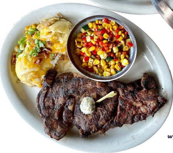
16oz Ribeye w/corn succotash and loaded mashed potatoes