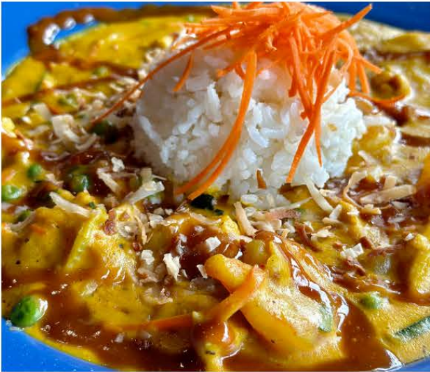
BonBon Chicken and Shrimp