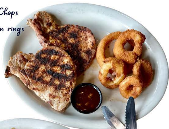
Pork Chops w/onion rings